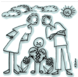
Flawed Family Law Kills

I have well over 500 plus documents to upload and prove my 'allegations', my dad was a very smart man who slipped his court files into my files before he passed without my knowledge and I believe he did so for a reason.